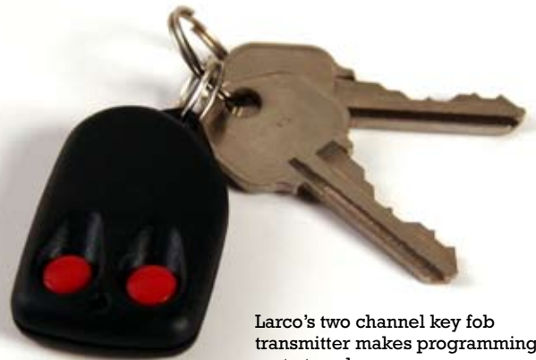
Larco's two channel key fob transmitter makes programming up to two doors easy