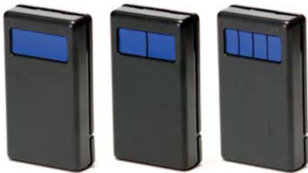
4 1/4" tall x 2 1/4" wide