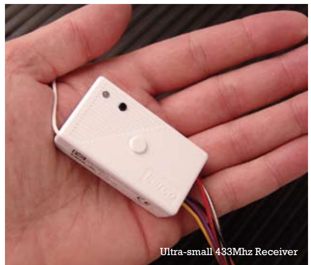
Ultra-small 433Mhz Receiver